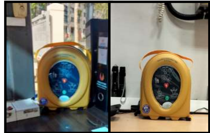
Inside FCC and Main Gate