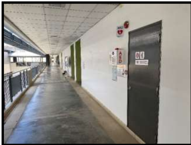
Outside MPH (Level 5)