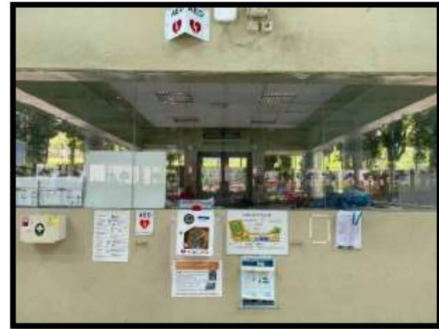
Swimming Pool (Control Room)