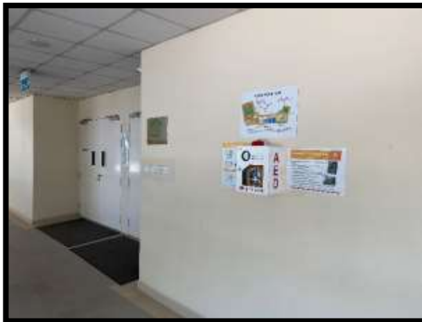
Auditorium (Back Entrance)