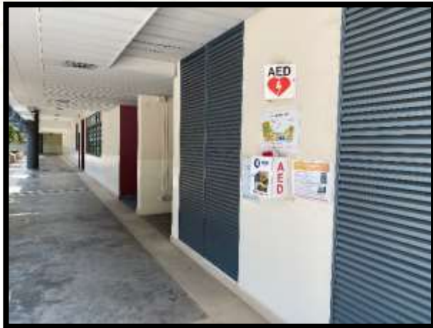
Outdoor Netball Court (Near Science Lab)