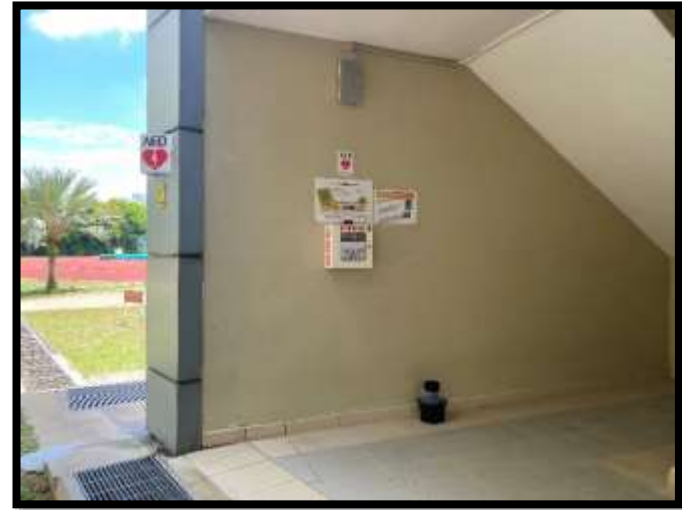
Behind Rally and Roar Café (staircase)