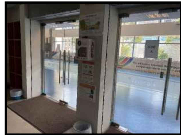
Outside Main Gym (3rd floor)