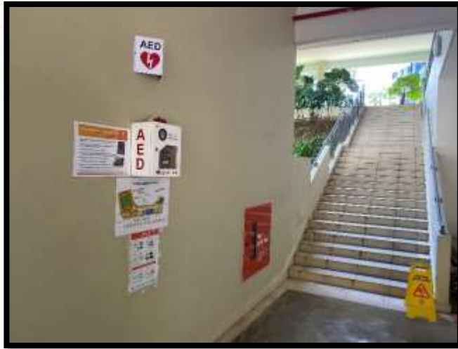
Staircase outside Bowling Centre